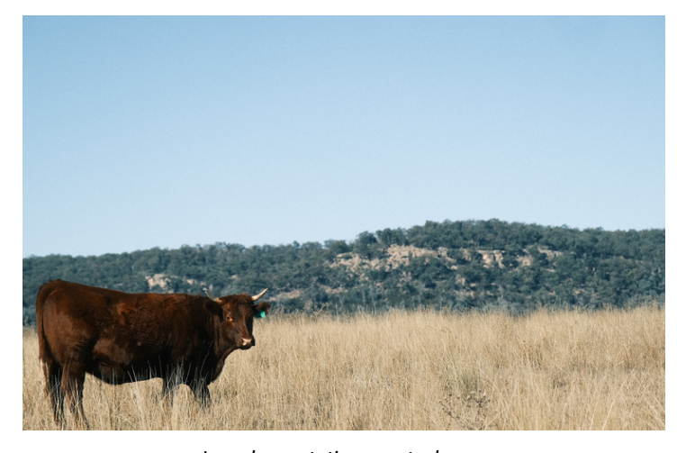
Local vegetation control

We always aim to make as much use as possible of local skills and expertise. We are very pleased that Mudgee-based A1 Earthworx has carried out the civil engineering work on the project's access road. There are further opportunities for local businesses and individuals to secure contracts or gain employment. We anticipate needing a workforce of up to 400. Submit your expression of interest via our website.