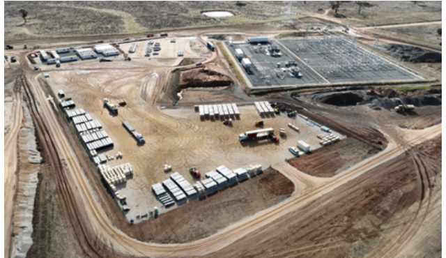
Flyover of the construction compound and newly constructed substation